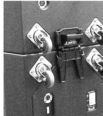
Hinge in a ground stack

The overall length of the Hinge allows for set ups with vertical angles of up to 15° between each cabinet.