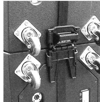
Hinge in a lashed column.