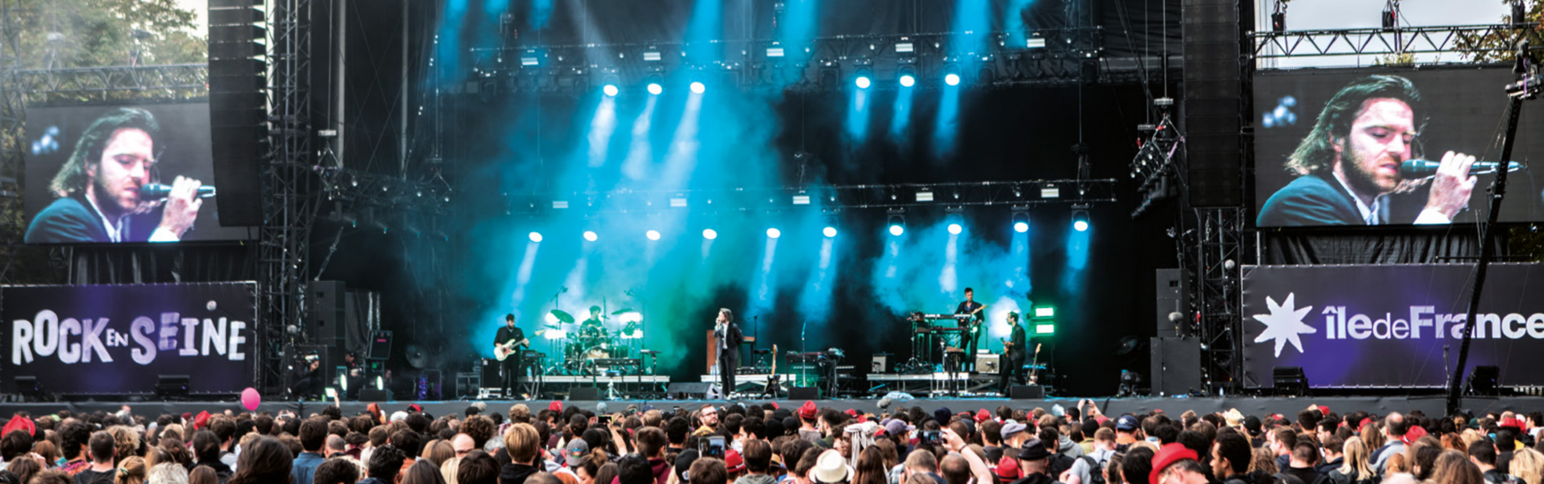
KSL for Rock en Seine Festival, Paris, France