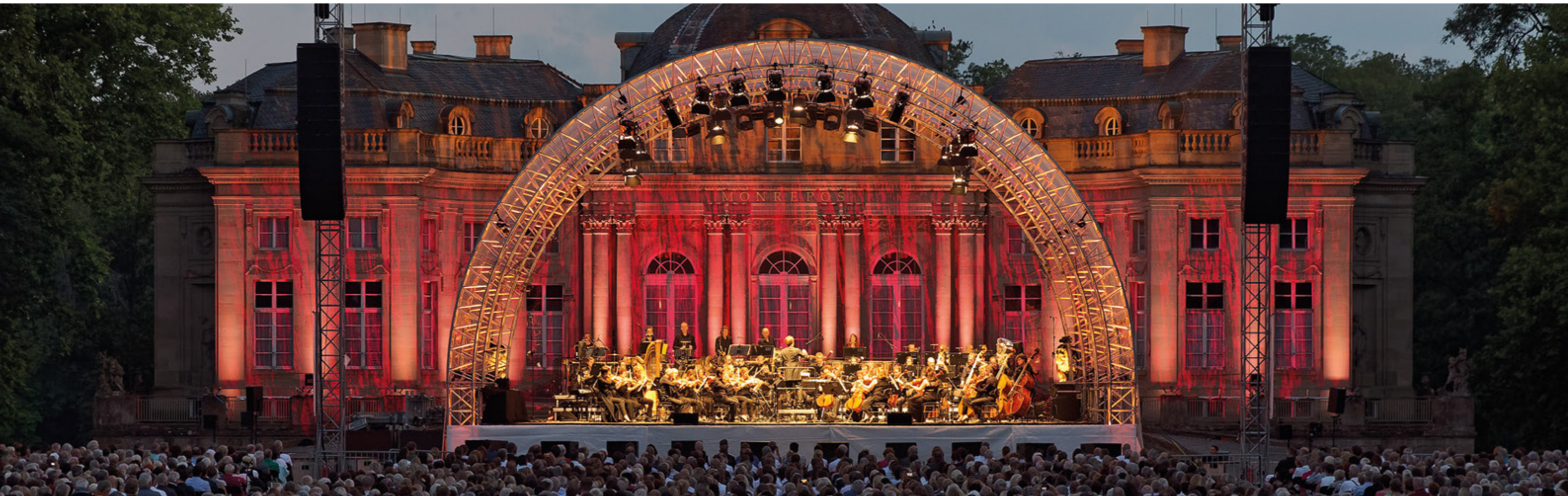
KSL for Klassik Open Air Monrepos, Ludwigsburg, Germany