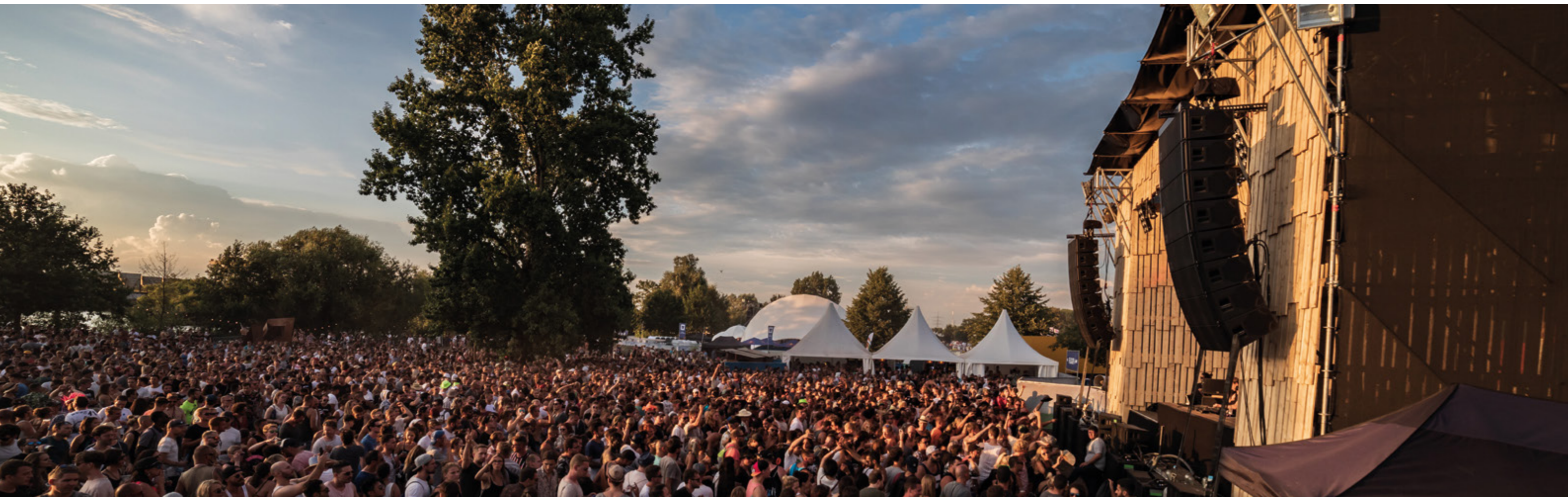
KSL for Love Family Park, Rüsselsheim am Main, Germany