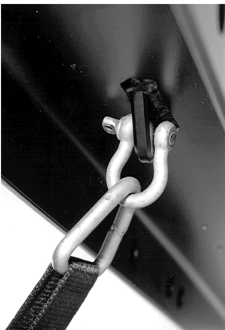
Delta link (E6511) and Shackle used to attach Ratchet strap (E6510) to the Flying bar

For parallel loudspeaker columns, all the load rigging chains attach to the U section of the Flying bar using Shackles. The fixing points for the Ratchet straps remain the same when the chain fixing points for angled loudspeaker columns are used. The Flying bar chainset is now attached to two fixing points on the outer edges of the bar and at two additional points at the centre of the U section of the Flying bar.